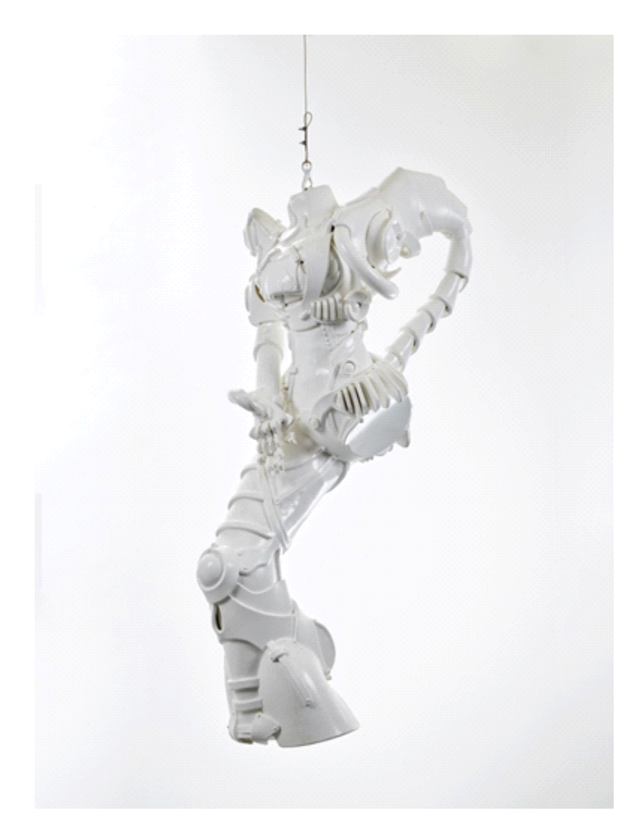
Figure 8. Bul Lee, Cyborg, W5 , 1999, Fiberglass reinforced plastic(FRP) with polyurethane coating, 150 x 55 x 90 cm, National Museum of Modern and Contemporary Art, © Bul Lee Studio

female bodies is replaced by cold, but glamourous female bodies optimized for any task.