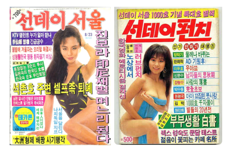
Figure 5. Cover image of Sunday Seoul , issue no. 970 (August 23) in 1987 Figure 6. A Special Appendix Volume "Sunday Punch" of Sunday Seoul to celebrate its thousandth issue in 1988

The Park Chung-hee regime ended in 1979. Sunday Seoul remain -ed popular throughout the 1980s and ended in 1991. As shown in the examples in 1987 and 1988, the magazine featured semi-nude female bodies with eye-catching headlines (Figure 5 and 6). An erotic undertone of yellow journalism promoting sensationalism, however, did not touch the most humiliating business of yang-gongju (prostitutes serving foreigners) and Giji-chon/Camptown (pleasure quarters outside U.S. military camps) serving soldiers stationed in South Korea (Moon 1997). Called wi-an-bu, sex workers servicing U.S. soldiers were controlled by the South Korean government from the late '50s to the late '80s (Cheng 2010 ; Lee 2010).<sup>5</sup>