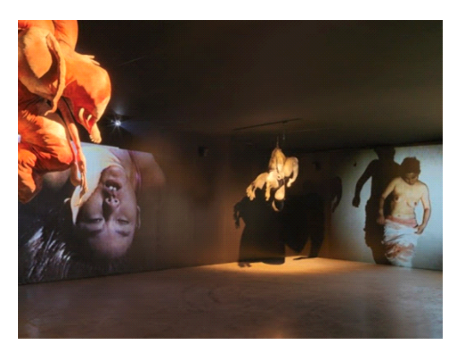
Figure 7. Bul Lee, Abortion , 1989, installation views displayed at the Seoul Museum of Art in 2021

Abortion had long been illegal in South Korea. Medical professionals who assisted pregnant women to terminate pregnancies without medical reasons could be punished. However, abortion procedures were common and numerous from the 1960s to the 1990s. The government-sponsored family planning policy turned a blind eye to abortions for both married and unmarried women. Gender-selective abortions were also common. Lee's sensational performance of the abortion highlighted the moral degradation of Korean society.