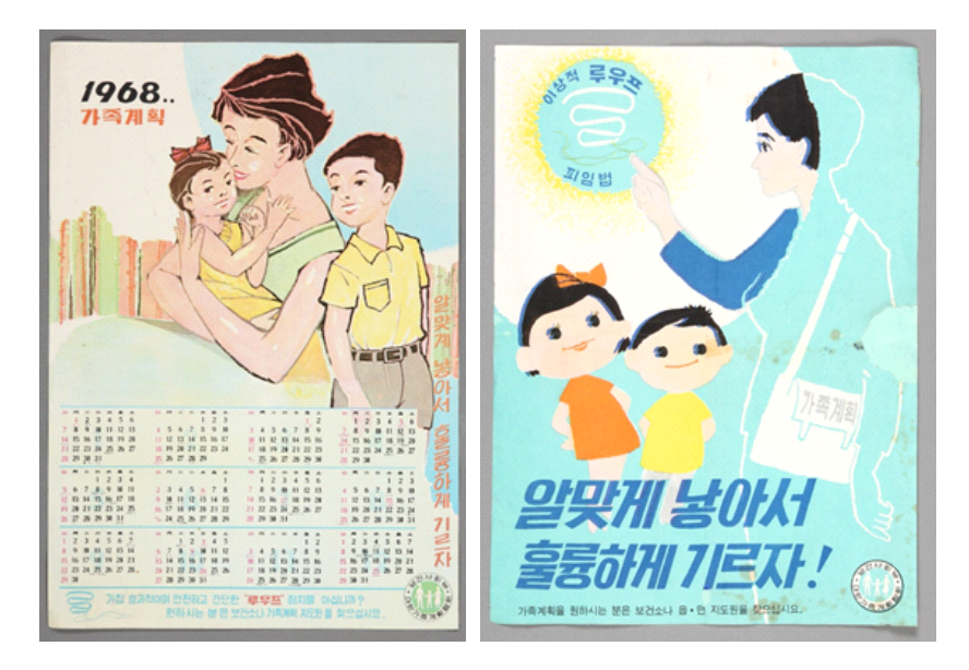
Figure 2. Family Planning Poster by the Ministry of Health and Welfare and the Korean Family Planning Association, 1968, print on paper, 54 x 38 cm, National Folk Museum of Korea

Figure 3. Family Planning Poster, by the Ministry of Health and Welfare and the Korean Family Planning Association, 1960s, print on paper, 52.5 x 39 cm, National Folk Museum of Korea